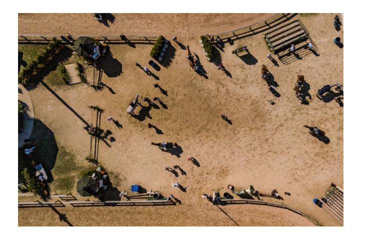
All rings on the property will be replaced with new footing and the outdoor arenas will also have updated drainage systems.