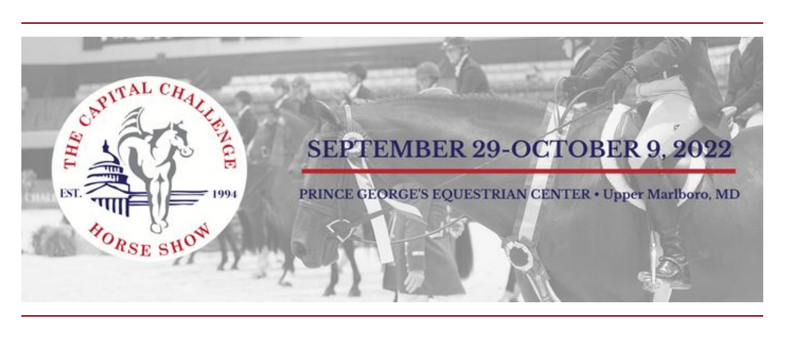
f 🖸 🗖 🗞